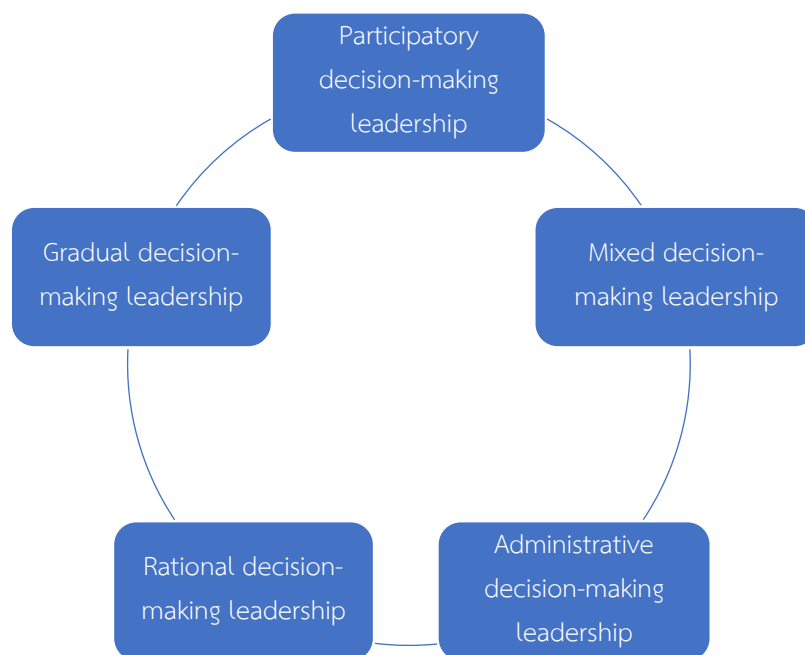
Figure 2 Body of knowledge

From figure 2, the study on decision-making behavior among educational administrators at Guangdong Open University highlights the following key findings